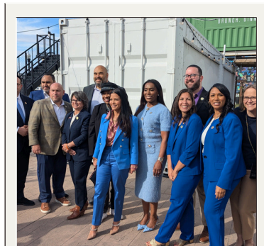
Members of NJ Assembly Freshman Class